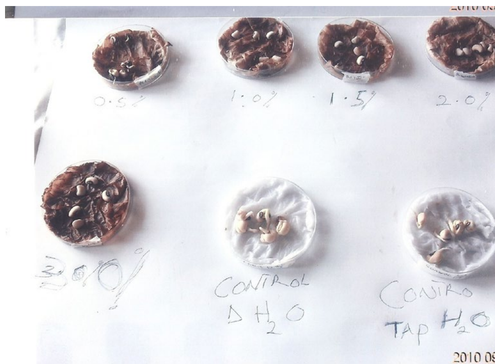
Plate 1. Germination of beans at the initial set up using seed extract.

Note: NB: Means with the same superscript letter are not significantly different at p = 0.05 .