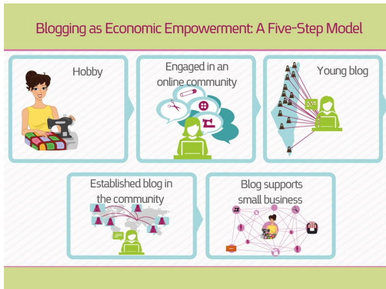
Figure 1: Blogging as Economic Empowerment: A Five-Stage Model

three-stage process that began at Stage 3 of our model. Following is a detailed description of each stage of the model and the roles of sharing and empowerment in each stage.