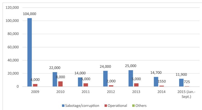
Figure 2. Volume of oil spills/year (per barrel (bbl)) (Shell, n.d.).

However, it is important to stress that other factors such as the increased risk of violence for resource rich and dependent countries (seen through the violent government response to Niger Delta protests (Omotola, 2009a, p. 141), the federal government’s control of natural resources 7 (Ikelegbe, 2001, pp. 437–438; Ojione, 2010; Oyefusi, 2014; Uche & Uche, 2004) and the level of oil and gas revenue allocated to oil- and gas-producing states (Bain et al., 2015, p. 2; Dibua, 2005; ICG, 2006, pp. 12–13; Uche & Uche, 2004) through the derivation rule 8 (Aghedo, 2015, pp. 148–149) have directly contributed to these oil sabotage incidents.