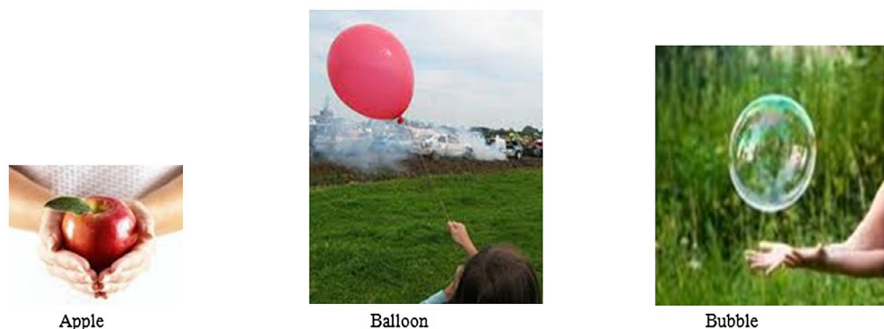
Figure 1. An example of the questions for LUSSC.

Official permissions for kindergarten students were obtained from educational directorates of the region. While collecting data from the kindergarten students in the study, assistance was received from the prospective teachers who were in the final year of the preschool teacher training program. The scale was performed by one-on-one meetings. Different methods were used while applying the scale to the kindergarten students. Sometimes kindergarten students were asked the questions that were prepared in PowerPoint on computer, through which data were collected. Sometimes, color printouts were taken for the questions and choices, then they were pressed, and then each question