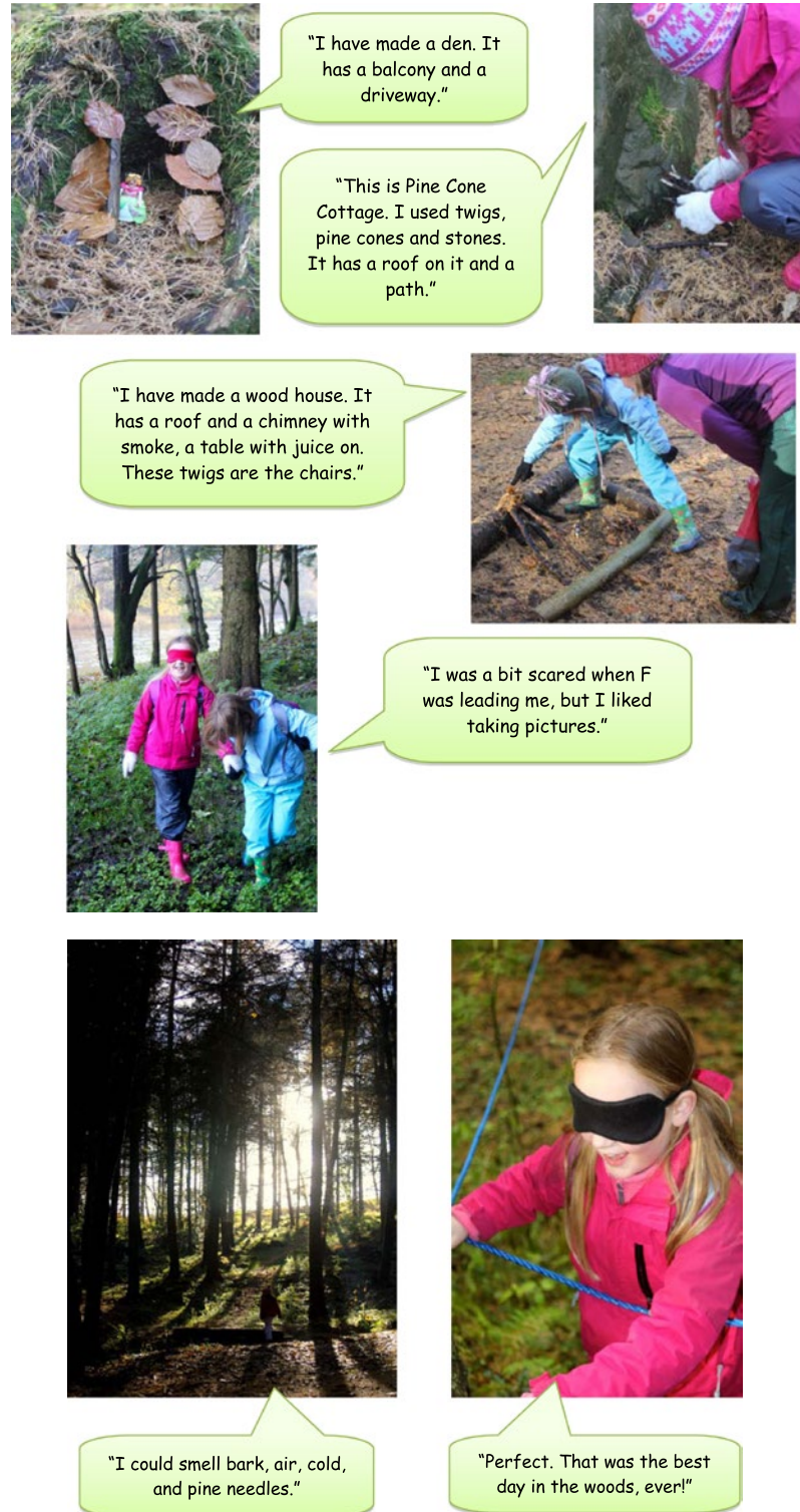
Figure 4. Exploratory Forest Schools day.